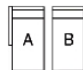
Chaiselong TE - CH - A 37,8 x 61"